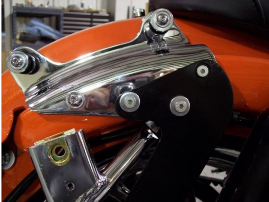
Step 8- Top of Strut Installation with 3 Bolts and Docking Hardware please note that not all Harley's will have 3 Docking Locations. (DO NOT REMOVE CHROME PLATE.)