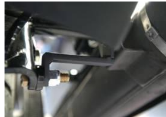
Step 22-Z-tab viewed from rear on right side. Upper bolt installation blocked by brace plate.