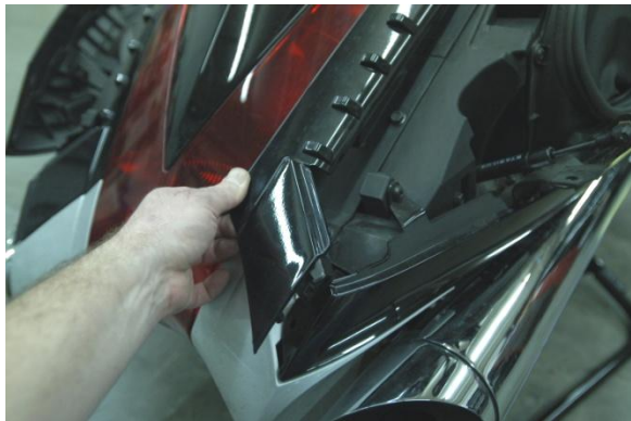
Step 8-Removal of taillight surround panel