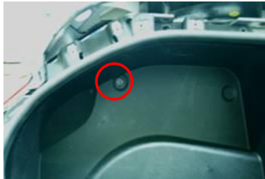
Step 13 & 14-Removal of bolt inside cavity.