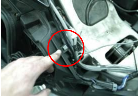
Step 13 & 14-Removal of wire clip.