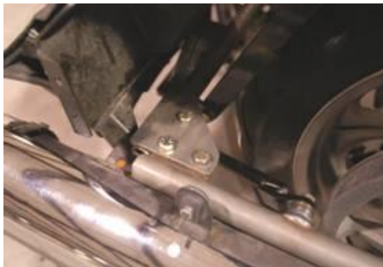
Step 19-21-Long strut to outside of upper hole in center section, short strut from threaded boss on side arm to lower hole on center section, and center section plate on top of corresponding side arm plates.