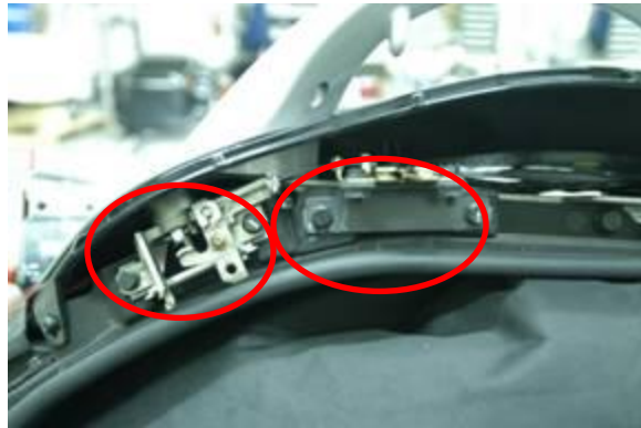
Step 13 & 14-Removal of pushbutton and latch.