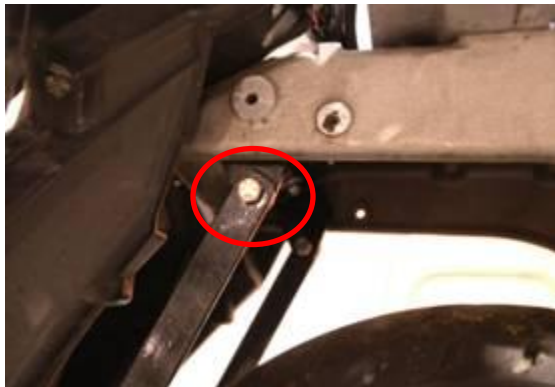
Step- 16-Mounting of strut plate to underside of frame.