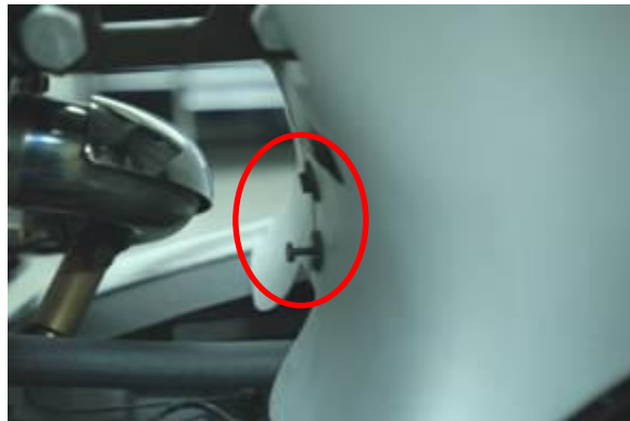
Step 11-Removal of plastic rivets in brushed covers.