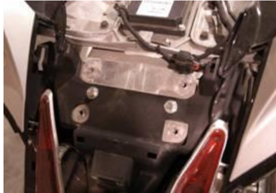
Step 15-Hex bolts on trunk mounting pad.