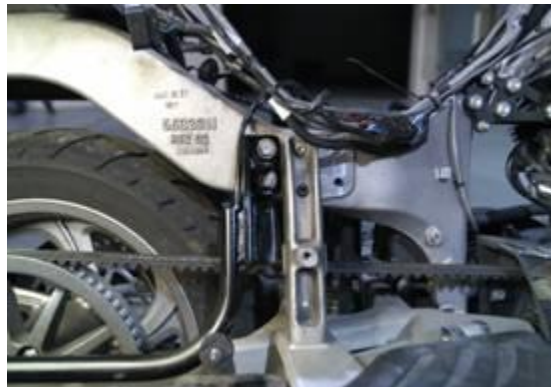
Step 17 & 18-Two bolts just behind casting. Right side shown with arm installed.