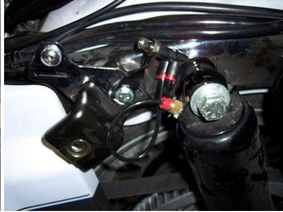
Step 15 & 19- Installation of Schrader Valve with Relocation Bracket

Bushtec Products Corporation 180 Mt. Paran Rd. Jacksboro, TN 37757 (888) 321-2516 * (423) 562-9911 Fax www.bushtec.com * E-mail info@bushtec.com