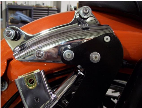
Step 8- Top of Strut Installation with 3 Bolts and Docking Hardware