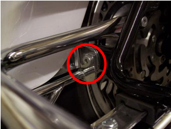
Step 5- Bolt connecting Lower Saddlebag Support to Rear Fender Support Plate highlighted

All Manufacturers names, model designations, brand names, trademarks and registered trademarks are the property of their respective holders.